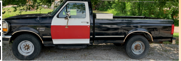
1996 Ford F350 XLT Diesel 4x2