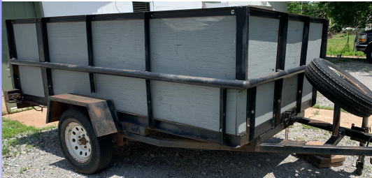
6'x10' Dump Trailer